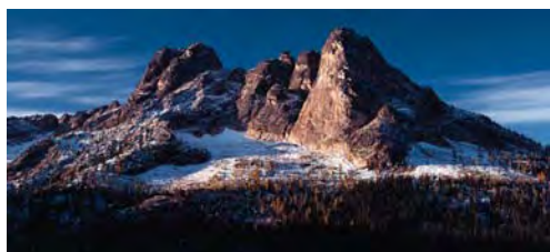
The view from the top is always better!

For those planning on taking the Spring Certification Exam, there is still time to apply for a scholarship. The deadline to apply is March 15, 2007. For the fall exams (September & November) the deadline is August 1 st . The application materials are available on the WAMSS Web Site. If you have any questions, please contact me at (206) 616-0890 or by email at - mcdonald@u.washington.edu